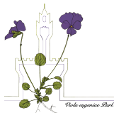
Società Botanica Italiana onlus