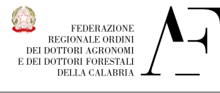
Ministero della Giustizia